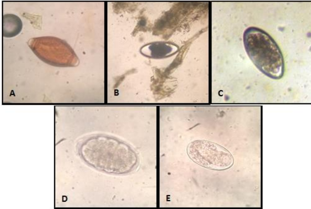
Figure 1. Nematode species found in O. aries feces.

A. Trichuris ovis ovum at 450× magnification. Trichuris spp. ova are typically brown and have a characteristic lemon shape with plugs at each pole. B. Nematodirus spathiger ovum at 100× magnification. Nematodirus spp. ova are characteristically very large with tapered ends and 4-8 cell morulas. C. Haemonchus contortus ovum at 450× magnification. D. Strongyle ovum at 450× magnification. Strongyle ova are typically small, ellipsoidal, smooth walled and contain a morula. E. Strongyloides ovum at 450× magnification. Strongyloides are typically smaller than strongyle ova and contain a rhabditiform larva in fresh fecal specimens.