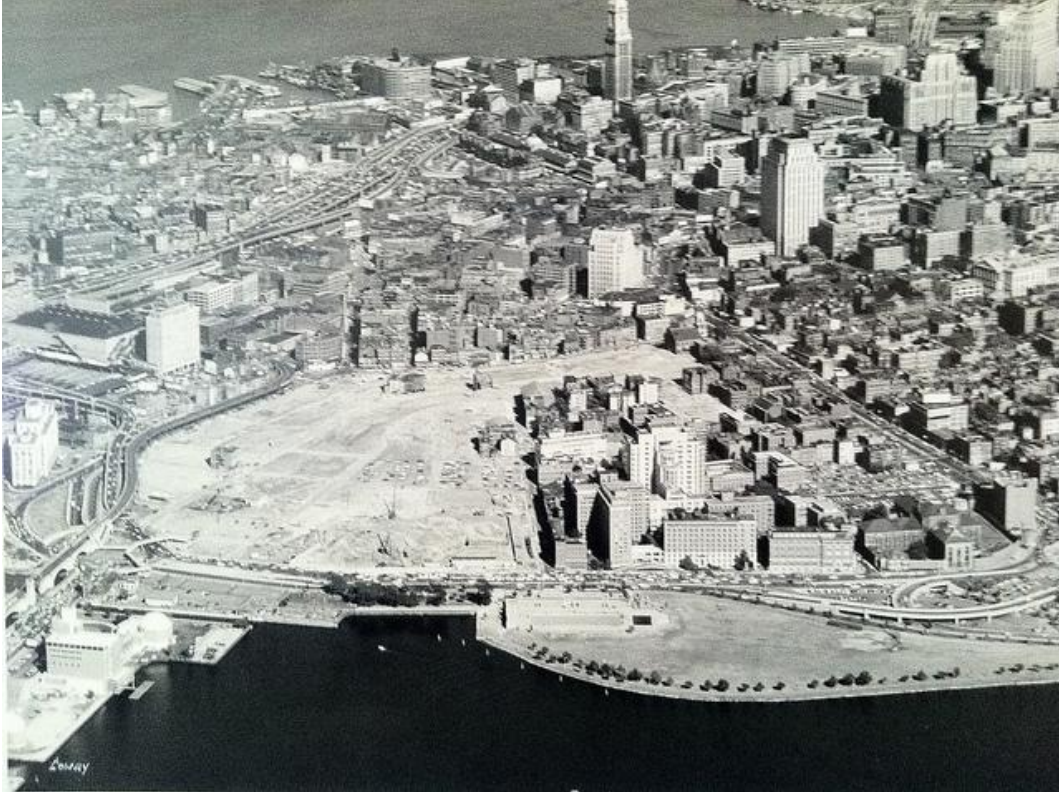
FIGURE 2. Aerial view of the West End neighborhood during urban renewal in 1959 (WEM 2015)