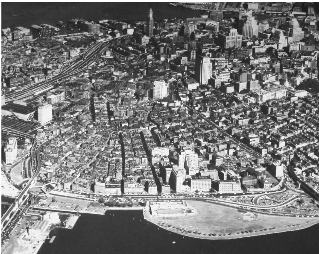
FIGURE 1. Aerial view of the West End neighborhood before urban renewal (WEM 2015)