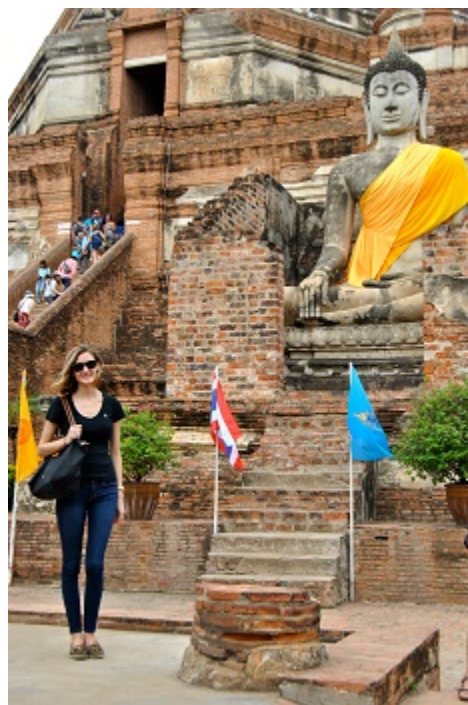
The author in Ayutthaya, the capital city of the ancient Kingdom of Siam.

This approach is especially relevant for the elderly, considering that people over sixty-five are the fastest growing segment of the population in most developed and developing nations (Luborsky and Kurn 1999). This demographic change is placing strain on the international economy as well as national healthcare systems and social welfare programs, thereby prompting the implementation of new policies regarding elderly care across many countries and cultures. Many long-standing policies, like the U.S. Older Americans Act (OAA) of 1965, promote “aging well,” “helping to maintain the health and well-being of seniors,” and “meeting the needs” of the elderly population, as stated in the OAA Brief released by the U.S. Department of Health. Yet, elderly populations carry a variety of culturally-specific views of “aging well.” As such, standardizing healthcare and health policy for the elderly, both within individual countries as well as