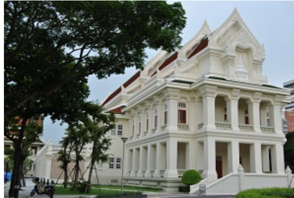
Chulalongkorn University is Thailand's leading research institution of higher education and the author's home base for her research.