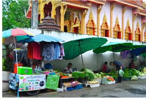
Food stands outside one of the 40,700 Buddhist temples in Thailand.

As with many cultures of Southeast Asia, Bangkok’s elderly informants stressed the importance of family support and care of the elderly. In every interview I conducted, informants expressed that it is in Thai blood, or Thai ways, to be good to your parents. One elderly respondent explained to me that this idea comes from the belief that, “If you do good, you will get good result. If you do bad, you will get bad result. So one of the really, really good causes is to take care of your parents. So if you do that cause, we will get many, many of the good things to our life.” The elderly also play a major role in the family dynamic. As a healthcare professional noted, the elderly often “take care of their grandchildren because parents have to work. So they play an important role in the social capital for the family.”