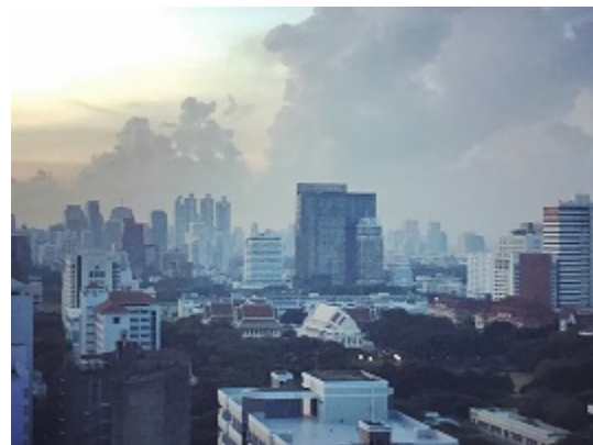
View from the author's apartment, overlooking central Bangkok with Chulalongkorn University's main campus at the center.

Although Thailand is a developed country and faces similar issues as the United States in terms of healthcare, during my research I was able to actually