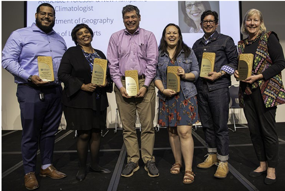
ALUMNI HONOREES AT THIS YEAR'S SUSTAINABILITY AWARDS.

Alumni, faculty, staff and students were recognized for their sustainability efforts during the third annual UNH Sustainability Awards on Tuesday, May 9.