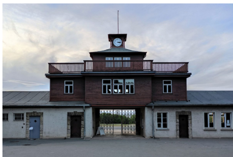
UNH STUDENTS ON THE BERLIN SUMMER PROGRAM VISIT THE SITE OF THE BUCHENWALD CONCENTRATION CAMP. PICTURED HERE IS THE GATE BUILDING OF THE CAMP.

interested in Jewish culture, Jewish history and just kind of connecting to each other.”