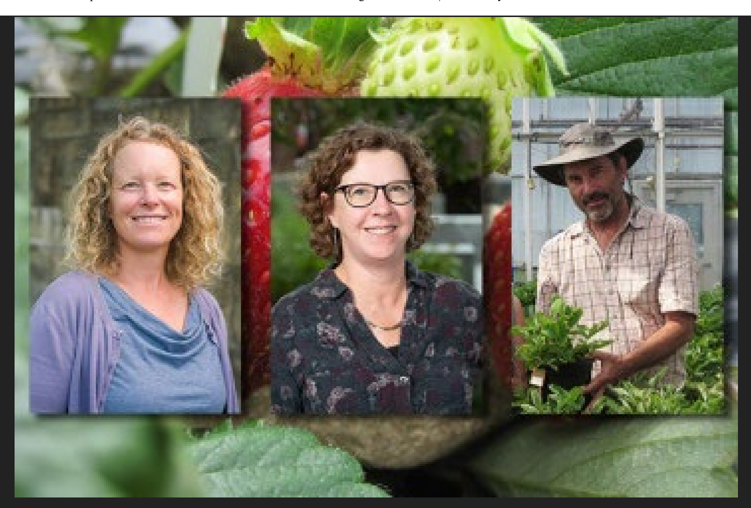
May 26, 2022 | NH AGRICULTURAL EXPERIMENT STATION