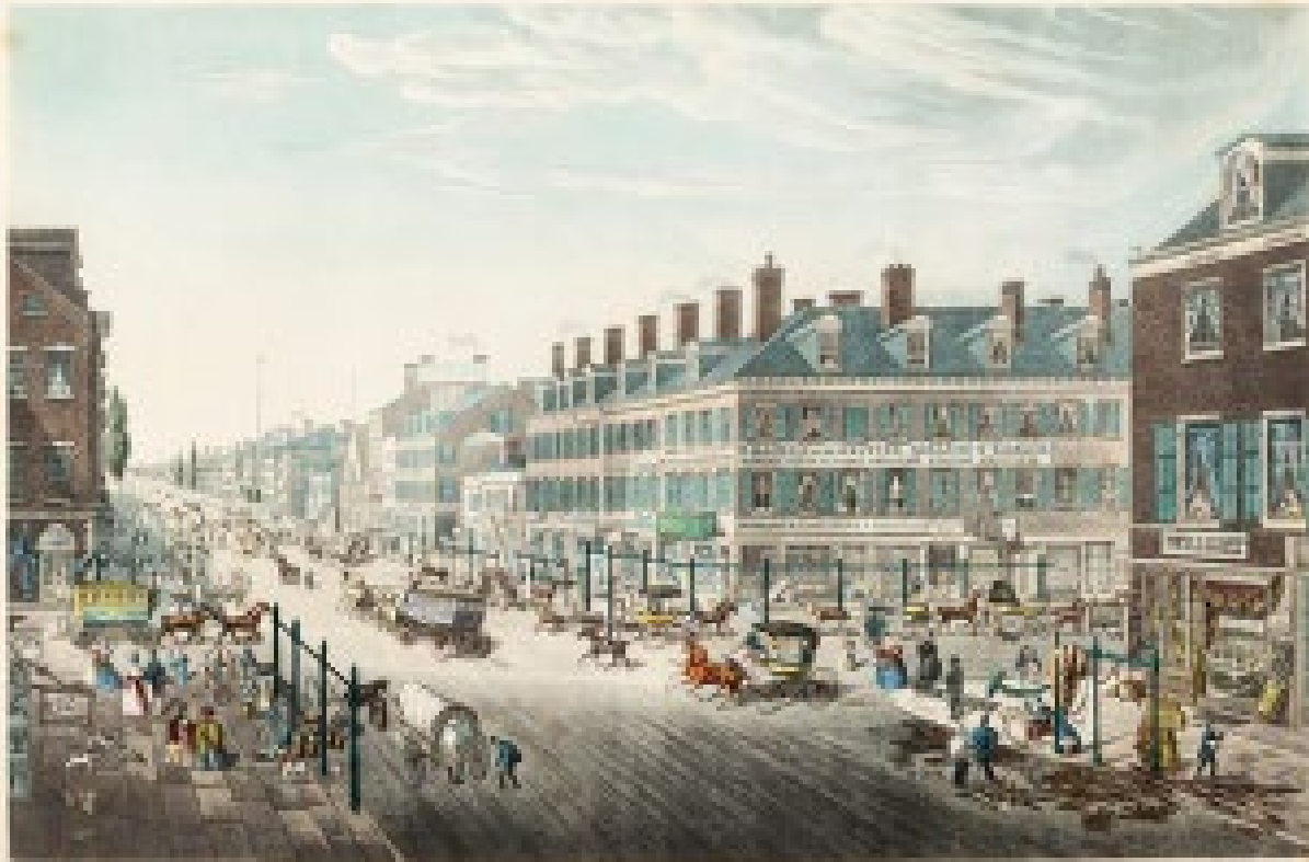
NEWBURYPORT, NEW JERSEY.

January 14, 2022 | COLLEGE OF LIBERAL ARTS