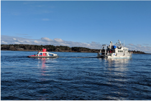
TESTING AN ASV IN PORTSMOUTH HARBOR FROM THE UNH/CCOM RESEARCH VESSEL GULF SURVEYOR.

DURHAM, N.H.—The University of New Hampshire is one of five internationally renowned ocean science institutions chosen by the National Oceanic and Atmospheric Administration (NOAA) over the next five years to explore an estimated three billion acres of U.S. ocean territory as part of the new Ocean Exploration Cooperative Institute ( https://urldefense.proofpoint.com/v2/url?u=https-3A__research.noaa.gov_article_ArtMID_587_ArticleID_2449_NOAA-2Dnames-2DUiversity-2Dof-2DRhode-2DIsland-2Dto-2Dhost-2Dnew-2Dcooperative-2Dinstitute-2Dfor-2Docean-2Dexploration&d=DwMFaQ&c=c6MrceVCY5m5A_KAUkrdoA&r=gk49I-YqmOGbrtzX3HbAPq8XDfJkq7dTqtXuPwlyXo&m=D2s9VuASOEfwFIRgaKgCUWsr0Un4dzabM1-9gnEL_RU&s=GIH9n3JyOOGACdfWy_hAsy6SCqV47ZK232nIMg2L6aE&e= ).