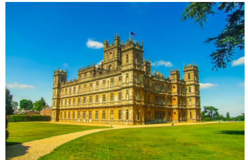
HIGHCLERE CASTLE, THE SETTING FOR DOWNTON ABBEY. STOCK PHOTO.