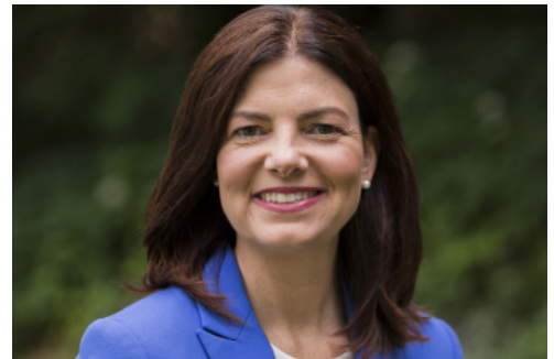
FORMER U.S. SENATOR KELLY AYOTTE (R-N.H.) WILL DELIVER THE KEYNOTE ADDRESS AT THE UNIVERSITY OF NEW HAMPSHIRE AT MANCHESTER’S COMMENCEMENT CEREMONY THURSDAY, MAY 18, 2017.

Ayotte received numerous awards for her legislative action. In 2016, the American Kennel Club awarded Ayotte the AKC Legislator of the Year Award for her sponsorship of the Pet and Women Safety Act, established to help victims of domestic violence find safe accommodations for themselves and