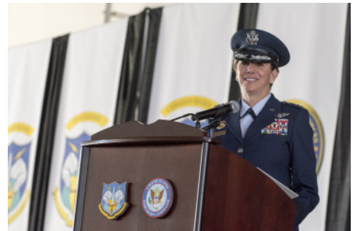
GEN. LORI ROBINSON ‘81, THE HIGHEST-RANKING FEMALE GENERAL IN U.S. HISTORY, WILL DELIVER THE UNIVERSITY OF NEW HAMPSHIRE COMMENCEMENT ADDRESS SATURDAY, MAY 20, 2017.

In 2016 Robinson took over as commander, North American Aerospace Defense Command (NORAD) and U.S. Northern Command, after entering the Air Force more than 30 years earlier through the ROTC program at UNH. NORAD conducts aerospace warning, aerospace control and maritime warning in defense of North America. Established after the Sept. 11 attacks, U.S. Northern Command (USNORTHCOM) partners to conduct homeland defense, civil support and security cooperation to