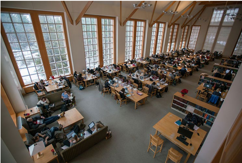
HUBBARD READING ROOM AT DIMOND LIBRARY