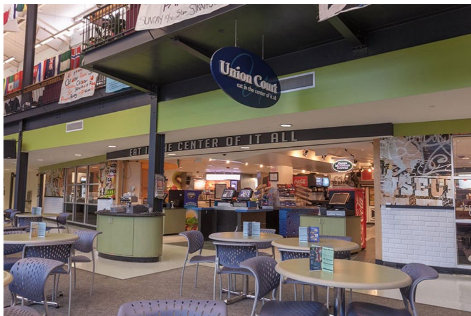
UNION COURT IN THE MUB

Union Court is always filled with people during the daytime, but it's a good place to meet up for group projects or studying with friends, especially when the crowds thin out in the evenings.