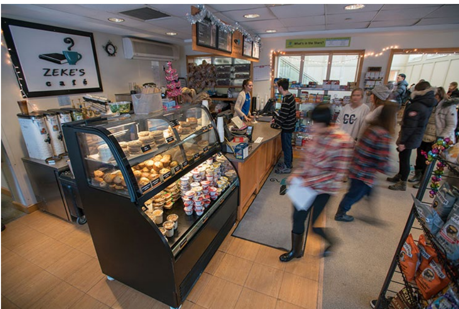
ZEKE'S CAFE IN DIMOND LIBRARY

If you like the library environment but don't mind some noise, try the tables outside Zeke's Café on the 4th floor of Dimond Library. As a bonus, you can easily grab a Starbucks coffee to keep your energy up.