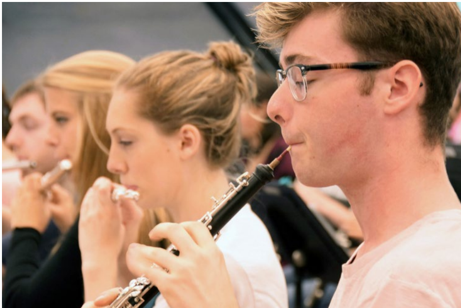
MEMBERS OF THE UNH WIND SYMPHONY DURING A RECENT REHEARSAL

Editor's note: After this article was published, the Wind Symphony premiered "Old Ben's Farm" at the Whittemore Center Arena before a full crowd assembled to usher in UNH's 150th year on Sept. 30. Video