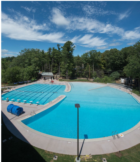
THE NEW OUTDOOR POOL IS OPEN.

Whether you're an incoming freshman or returning to campus this fall for your second, third or fourth year, we can't wait for you to arrive. A lot's been going on while you were away — degree programs were developed, a pool was filled and lots and lots of elliptical machines were hauled into Hamel Rec. Here's a