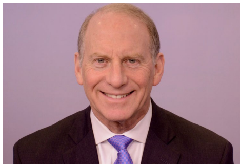
OF RICHARD HAASS

and honorary degree recipient Richard Haass has been praised in the U.S. and abroad for his commitment to resolving conflict.