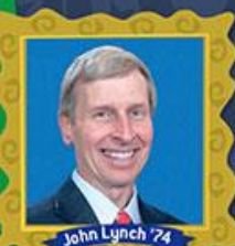
John Lynch '74

Twice selected as "the most fiscally responsible governor in America" and coinor of the phrase "the New Hampshire Advantage," Merrill served the state for two terms, from 1992-1996.