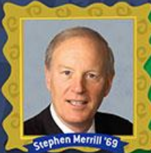
Stephen Merrill '69

Twice selected as "the most fiscally responsible governor in America" and coinor of the phrase "the New Hampshire Advantage," Merrill served the state for two terms, from 1992-1996.