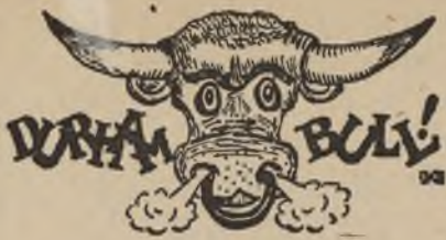
by Murray Aisenberg

For your enjoyment we announce the installation of new RCA High Fidelity Sound Equipment. One of the first since V-J Day!