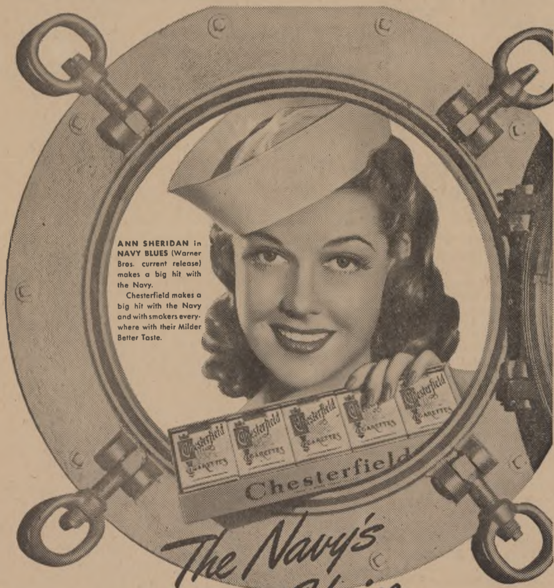
ANN SHERIDAN in NAVY BLUES (Warner Bros. current release) makes a big hit with the Navy.

Chesterfield makes a big hit with the Navy and with smokers everywhere with their Milder Better Taste.