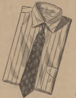
Sussex... $2, up

Sharpen up your neckline with this authentic new collar. In whites, colors, and stripes. $2 up. Arrow Ties $1 and $1.50