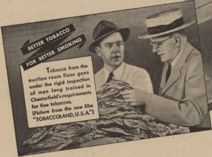
Copyright 1940, LIGGETT & MYERS TOBACCO CO.