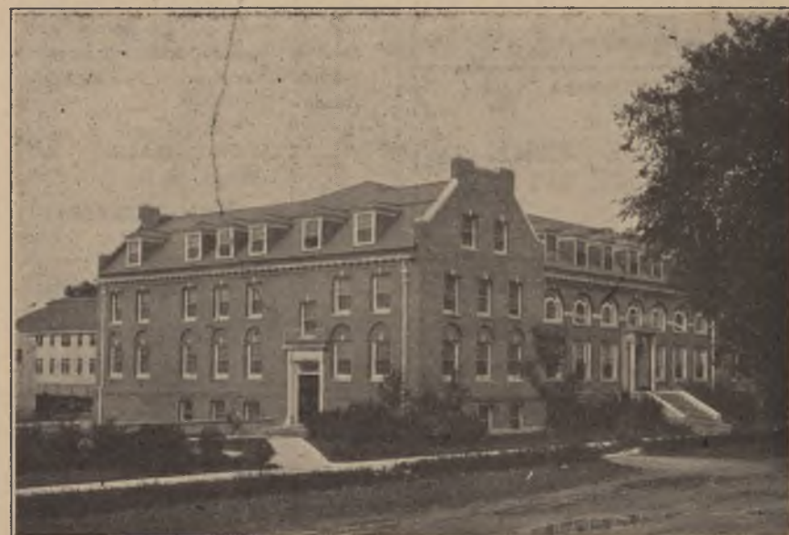
PIN THIS ON YOUR WALL AND AIM TO HIT THE SPOT IN PERSON ON JUNE 15.