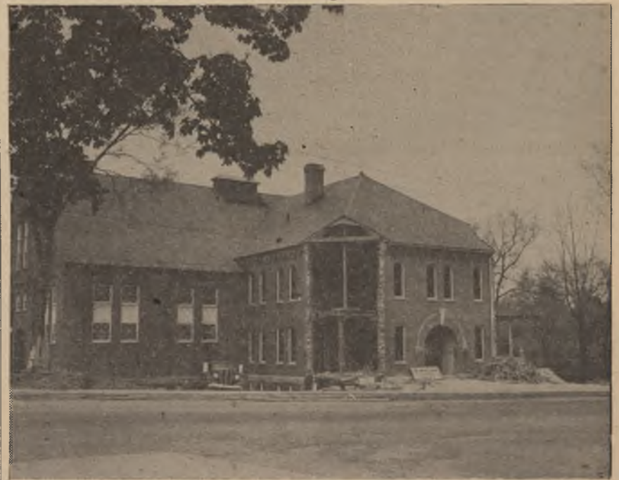
JUST THE FACE-LIFTING OF THE OLD GYM. HELPED BY ALUMNI FUND.