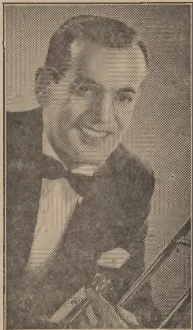
GLENN MILLER, New Dance King, now broadcasting over Coast-to-Coast C.B.S. Network, three times weekly, for Chesterfield.