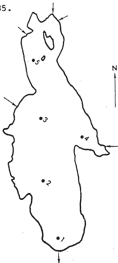
Figure 2. Silver Lake, Town of Madison, New Hampshire. Outline map and location of 1985 sampling sites.

Results from the lay monitors are presented separately from those of the Freshwater Biology Group, as the two groups conducted separate research. Conway Lake was sampled weekly at sites "1 South", "2 Deep", "3 Center", "4 East", and "5 North" from April 9 through October 16, 1985. A sixth site, "6 Big Island", was added in August. See Figure 2 for 1985 sampling sites and Appendixes A and B for lay monitor data from 1983-1985.