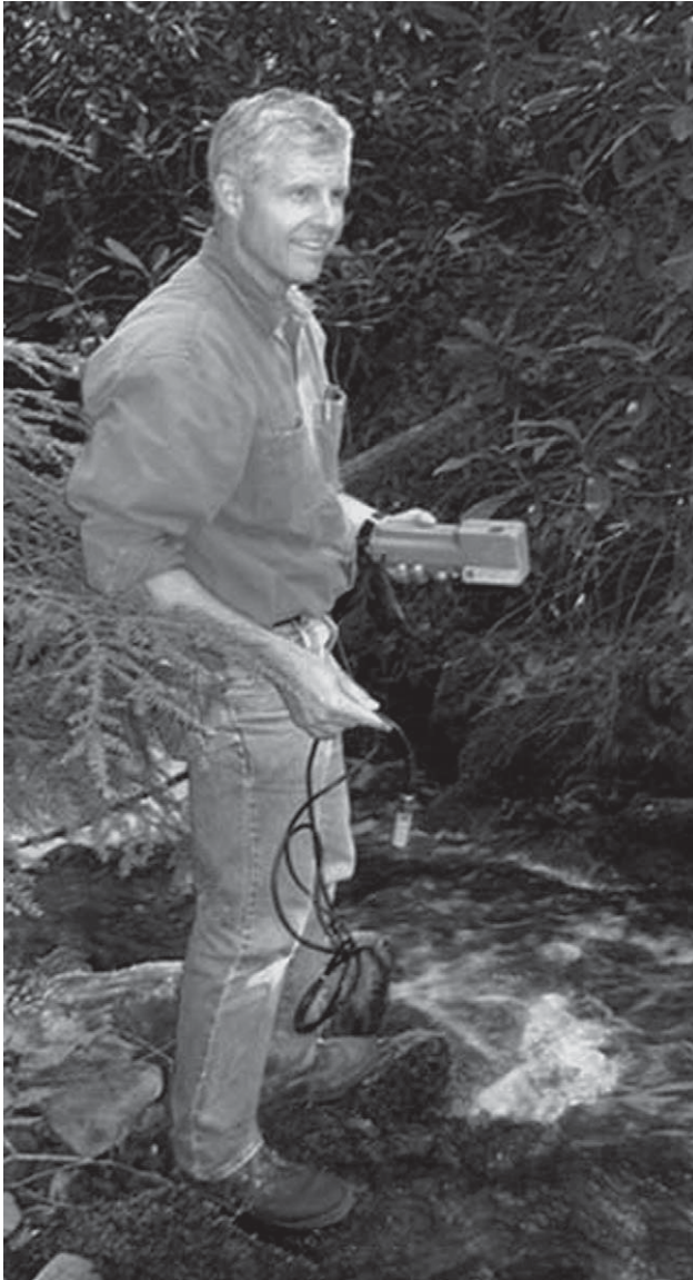
Figure 1. Patrick J. Mulholland (1952–2012), leader of the Lotic Intersite Nitrogen eXperiments (LINX).

physical data set (Zhang et al. 1999, Hubbard et al. 2013) through collaboration across the disciplines of hydrology, ecology, geography, and modeling. Collaboration between ecophysicists and hydrologists addressed the fate of water use by vegetation (Brooks et al. 2009). A large cross-continent experiment on terrestrial nutrient enrichment (NUTNET) has provided broad and general results (Borer et al. 2014). Like LINX, these studies were able to address large-scale scientific questions by applying disciplinary expertise to interdisciplinary problems through focused collaborative effort.