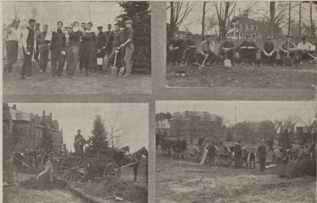
NEW HAMPSHIRE DAY.