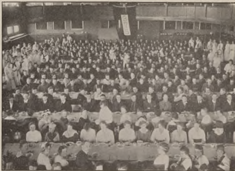
NOON HOUR—NEW HAMPSHIRE DAY.

The class in Animal Husbandry, 52, recently went on a trip to Colebrook to see the Balsam's stock farm and other live stock in that region. Leaving Durham on Thursday morning they arrived in Colebrook that night and established themselves in the Monadnock House. The next morning, they went first to the Balsam's stables,