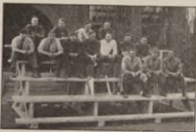
A BLEACHER GANG— NEW HAMPSHIRE DAY