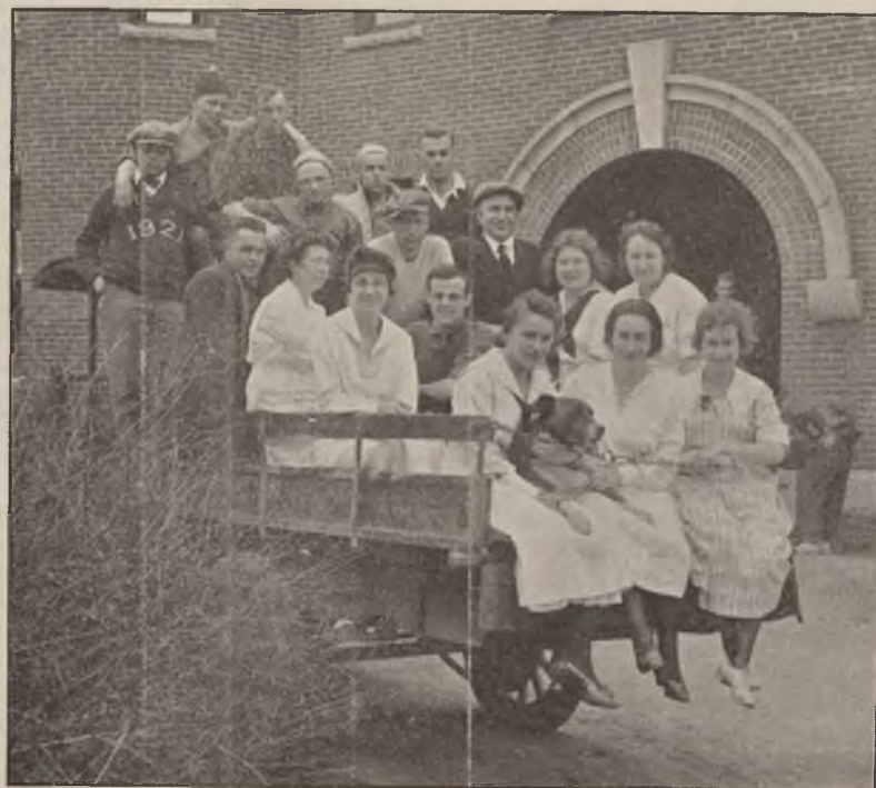
COMMISSARY DEPARTMENT—NEW HAMPSHIRE DAY.