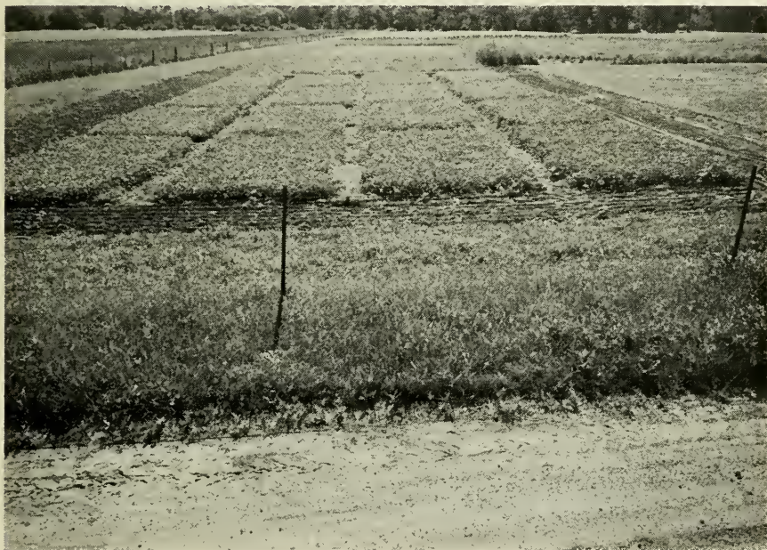
Ladino clover experimental plots at Strafford County Farm, Dover, N. H., July, 1960.