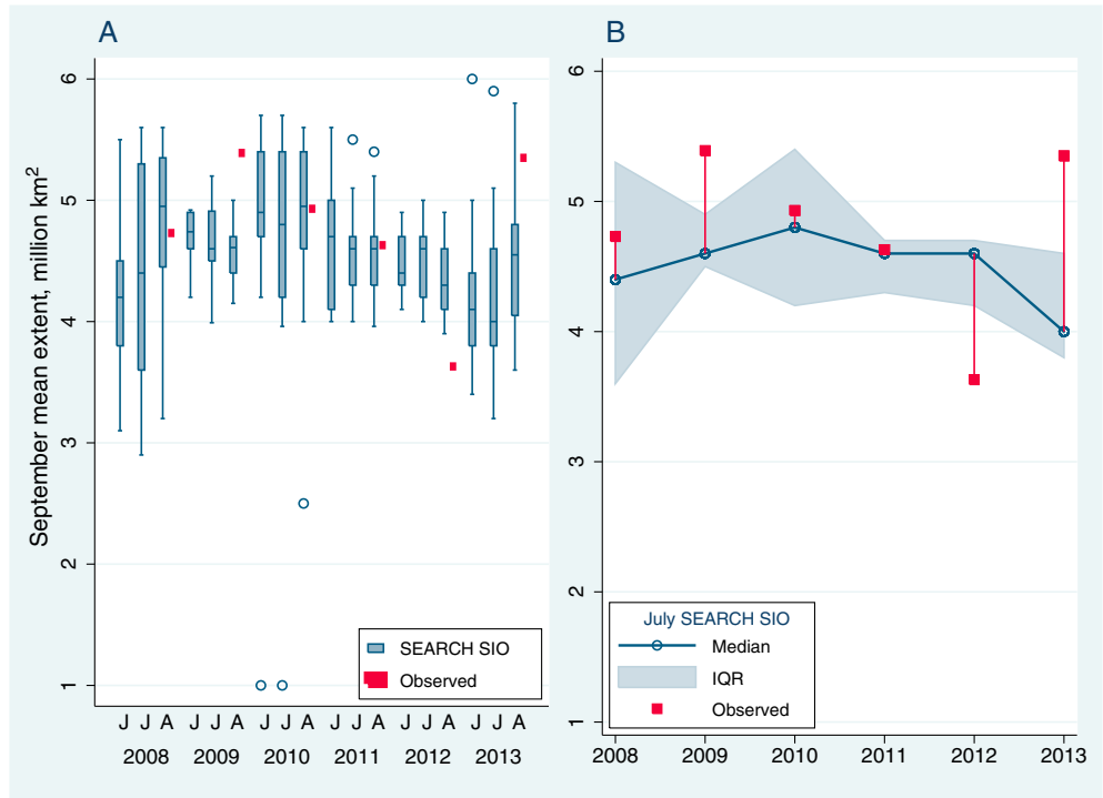
Figure 1. (a) SEARCH Sea Ice Outlook predictions for June, July, and August reports compared with the observed mean September ice extent, 2008–2013. (b) Median and interquartile range of the July SIO predictions compared with the observed mean September extent.