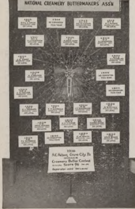
This display was part of the De Laval Exhibit at the National Dairy Show. One farmer's wife after gazing at it for a few minutes, was heard to remark to a friend: "That Proves that the De Laval is I-T it."

DE LAVAL SCORES 100% Butter made from cream separated by the DE LAVAL has won first prize in every contest held by the NATIONAL CREAMERY BUTTERMAKERS ASSN.