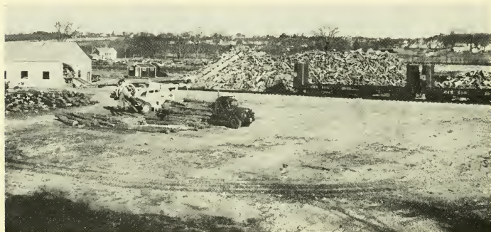
Hardwood logs are debarked and sawed to length for pulpwood bolts.

Changes in scale of operations can be indicated as increases or decreases (if there have been any changes). Those of greatest magnitude have been in the pulp mills where expansion in capacity and changes of process are notable.