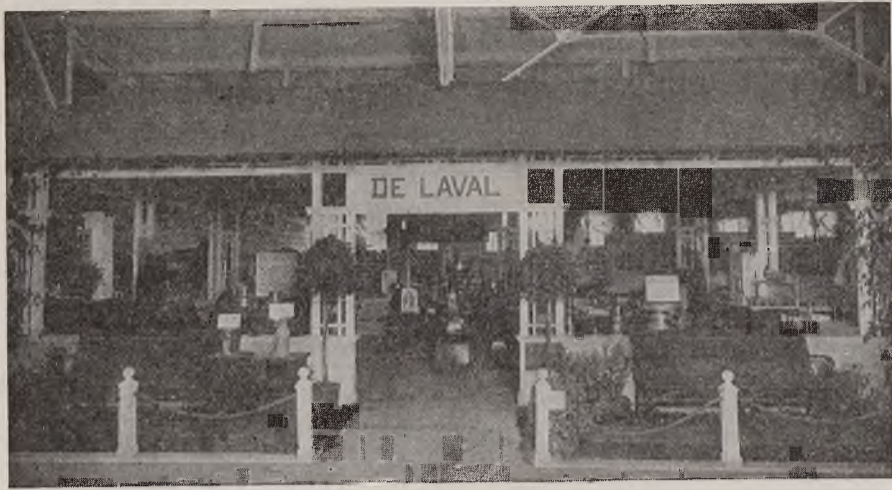
Attractive De Laval Exhibit at National Dairy Show, Chicago, October, 1914.