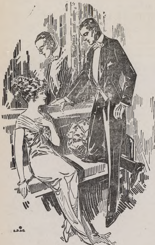
Society Brand Clothes