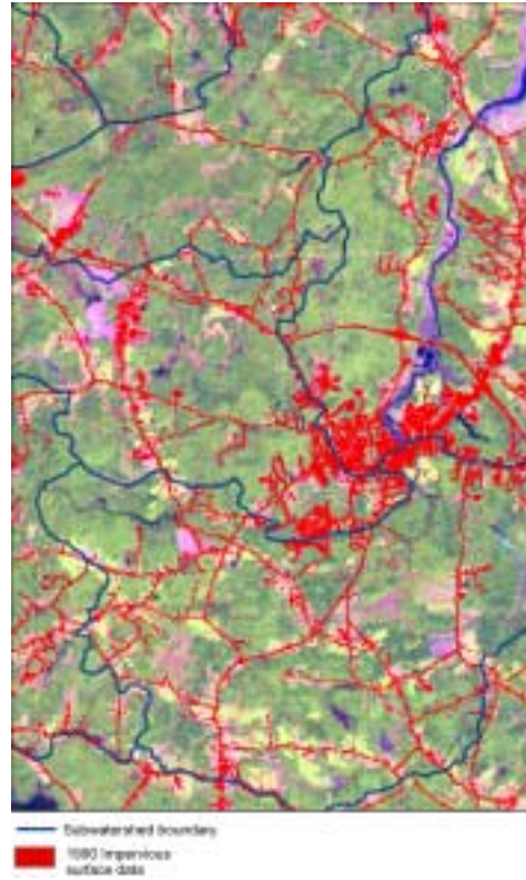
Figure 6. Regional mapping of impervious surfaces, 2000, for the Exeter, NH vicinity.