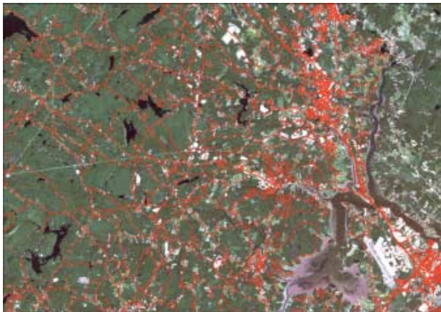
Figure 2. Georeferenced Subset of Landsat 5 Thematic Mapper Image (bands 3, 2, 1 – acquired 9/8/90) for an area around Great Bay. Red vectors represent NH Department of Transportation road centerline data overlain on the source imagery.

The subpixel technique is non-traditional in nature. Best results are achieved by working with data sets having minimal resampling, and processed using the nearest neighbor technique. Adherence to this rule requires that a geographic transformation model be developed and used to georeference the final data set. This was conducted for both the 1990 and 2000 image data. Figure 2 illustrates the base 1990 TM data after being georeferenced using the model transformation.