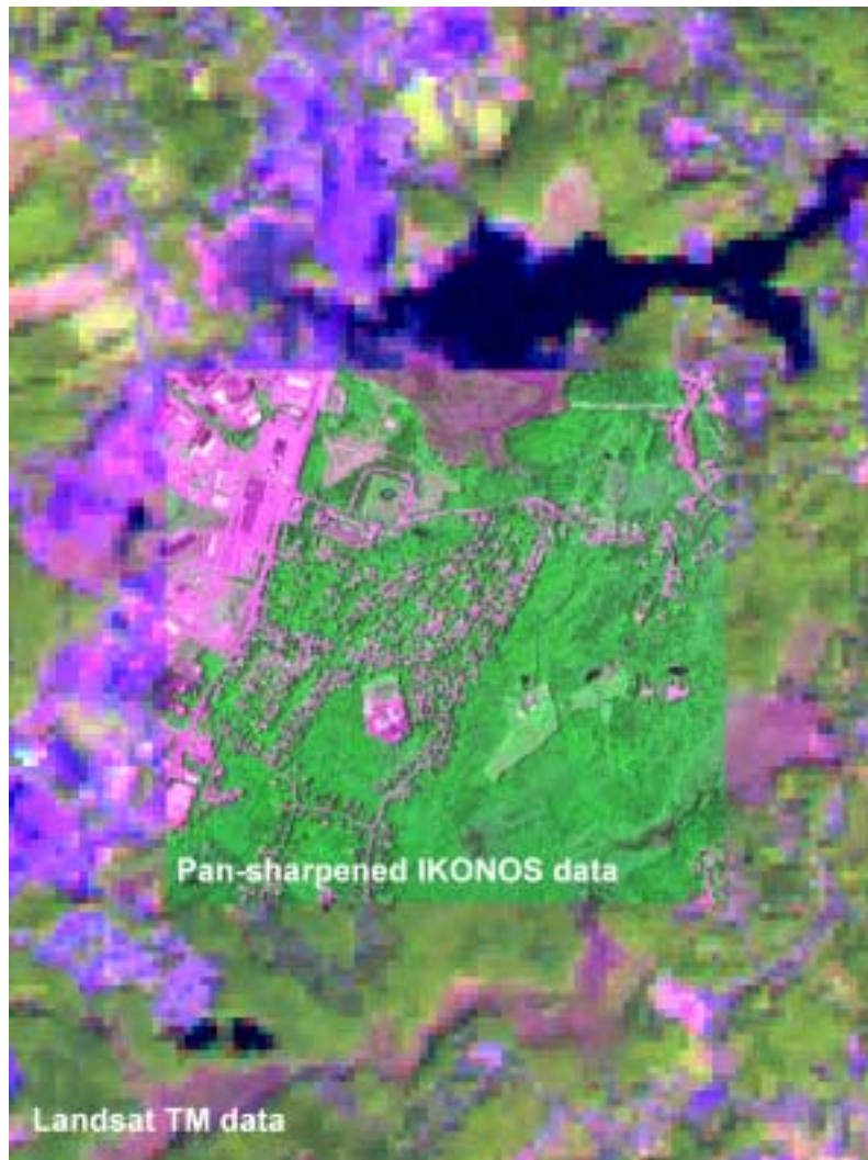
Figure 7. Comparison of IKONOS 1-meter imagery and Landsat Thematic Mapper 30-meter imagery