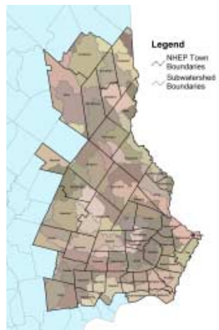
Figure 1. Subwatersheds within Project Study Area

The regional mapping phase utilized 30-meter resolution TM imagery to generate an estimate of impervious surface acreage for two years: 1990 and 2000. The GRANIT database, resident at Complex Systems Research Center, contained an archived image