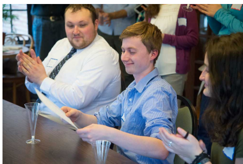
Scholarship winners at a recent event.

A total of 11 study-abroad scholarship winners were honored by the Center for International Education and Global Engagement this spring.