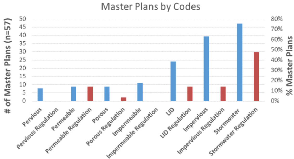
Figure 2. Occurrence of Stormwater Related Terms in New Hampshire Master Plans.