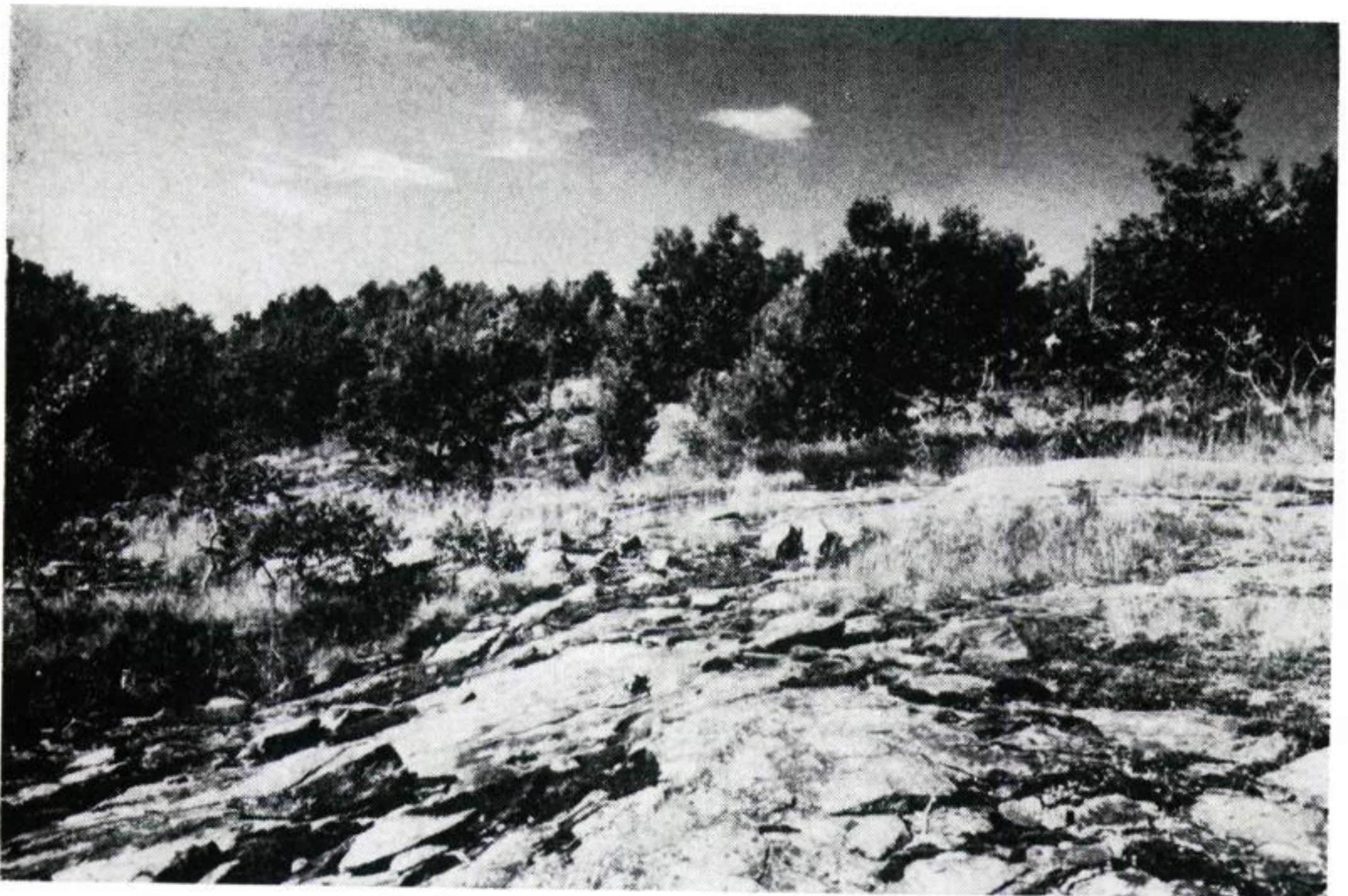
Figure 4. Barren ridge-top on the Precambrian Shield in Matchedash Township, Simcoe County, Ontario. Spiranthes casei was quite frequent on this ridge, growing in coarse shallow soil in open locations.