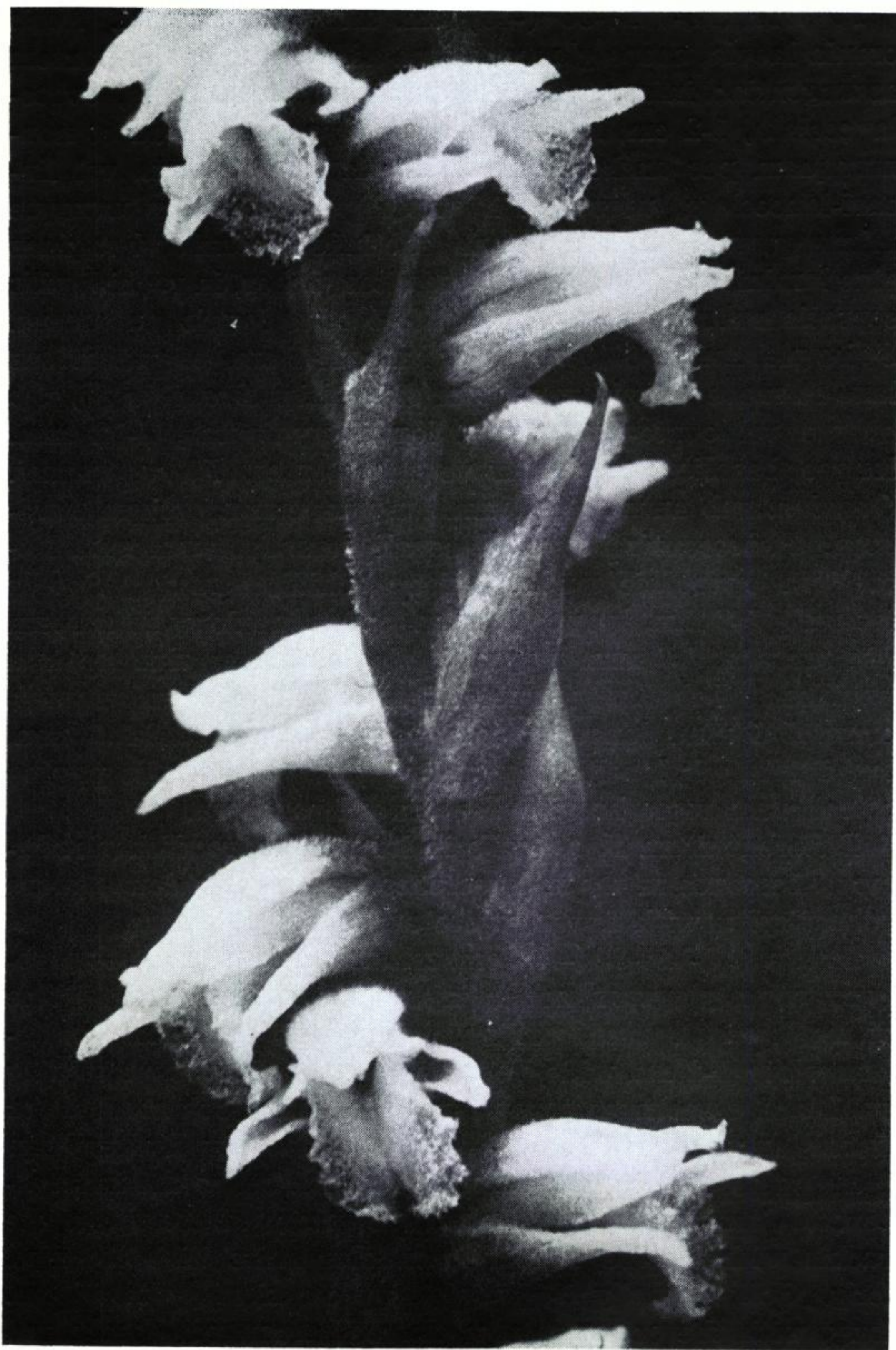
Figure 2. Part of a spike of Spiranthes casei from Dorset, Ontario.