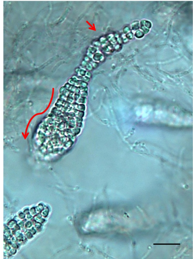
Figure 1. Photomicrograph of Frankia sp. strain CcI49 grown in liquid culture. The elongated arrow shows the presence of a long, narrow sessile sporangium containing differentiated mature spores at distal end (short arrow). Size bar represents 32 \mu m.

contained a total sequence length of 9,758,130 bp with a G+C content of 70.5%.