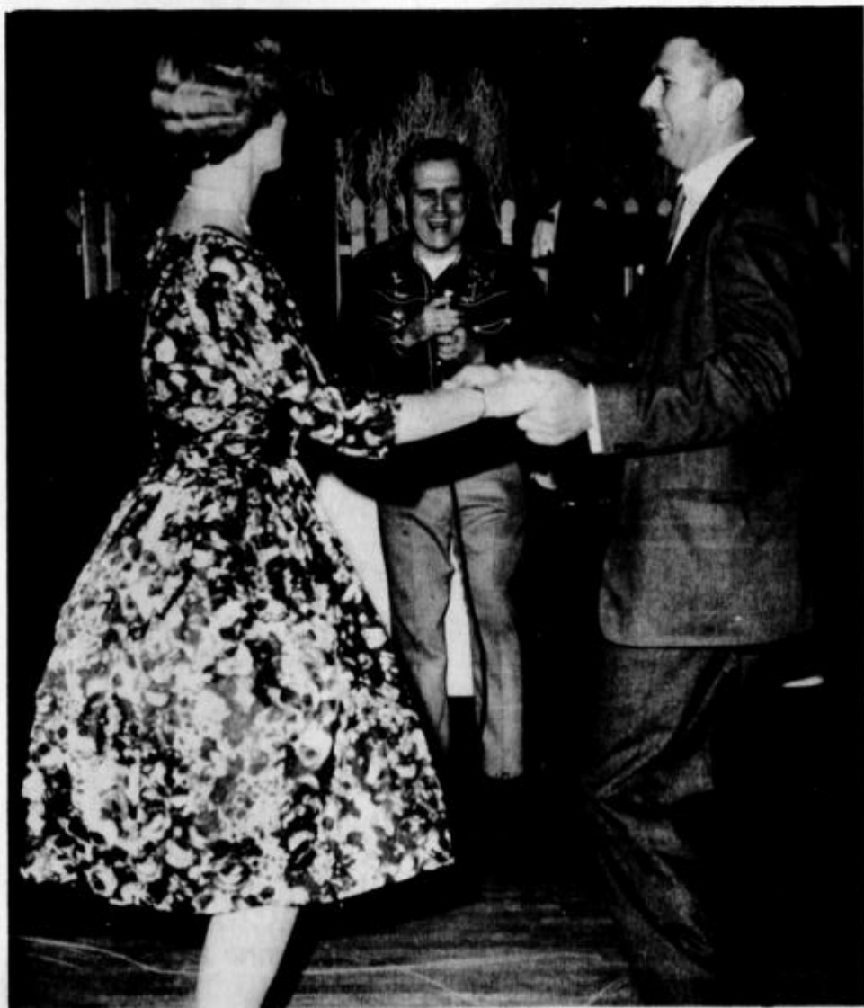
SQUARE DANCING IN GREENWICH VILLAGE