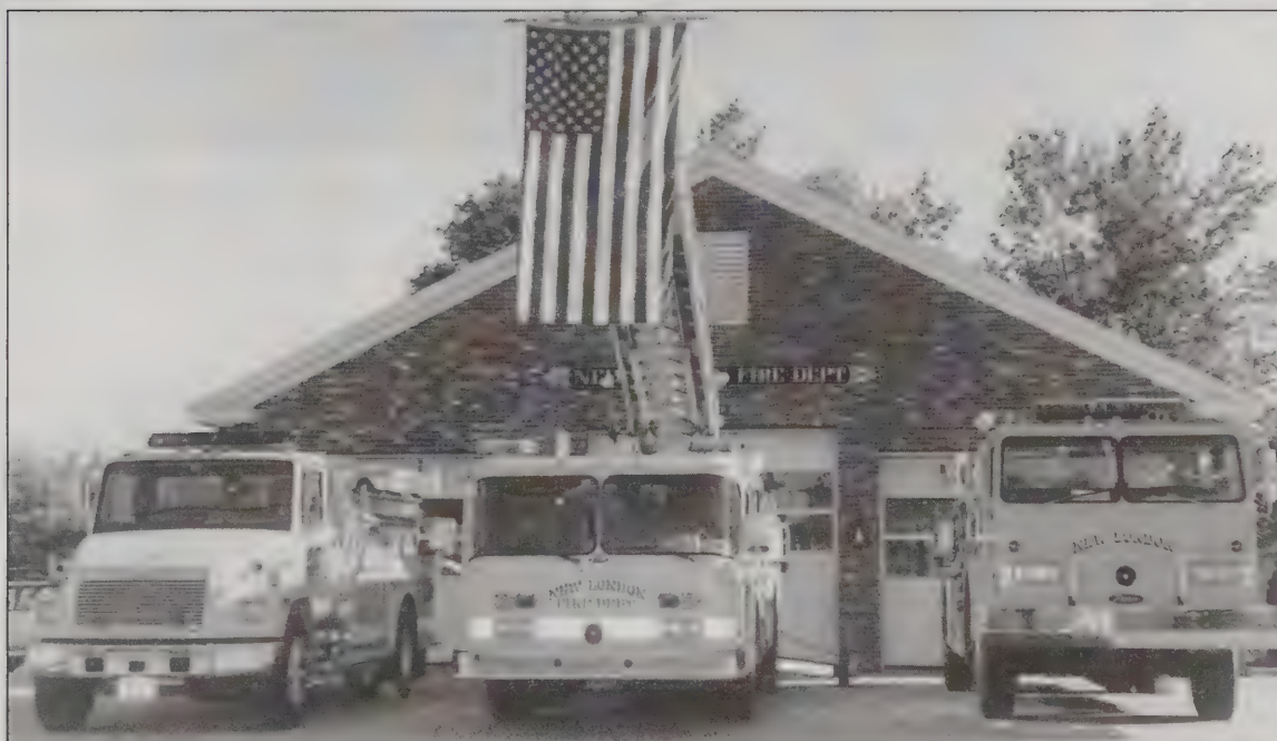
Intertown Record