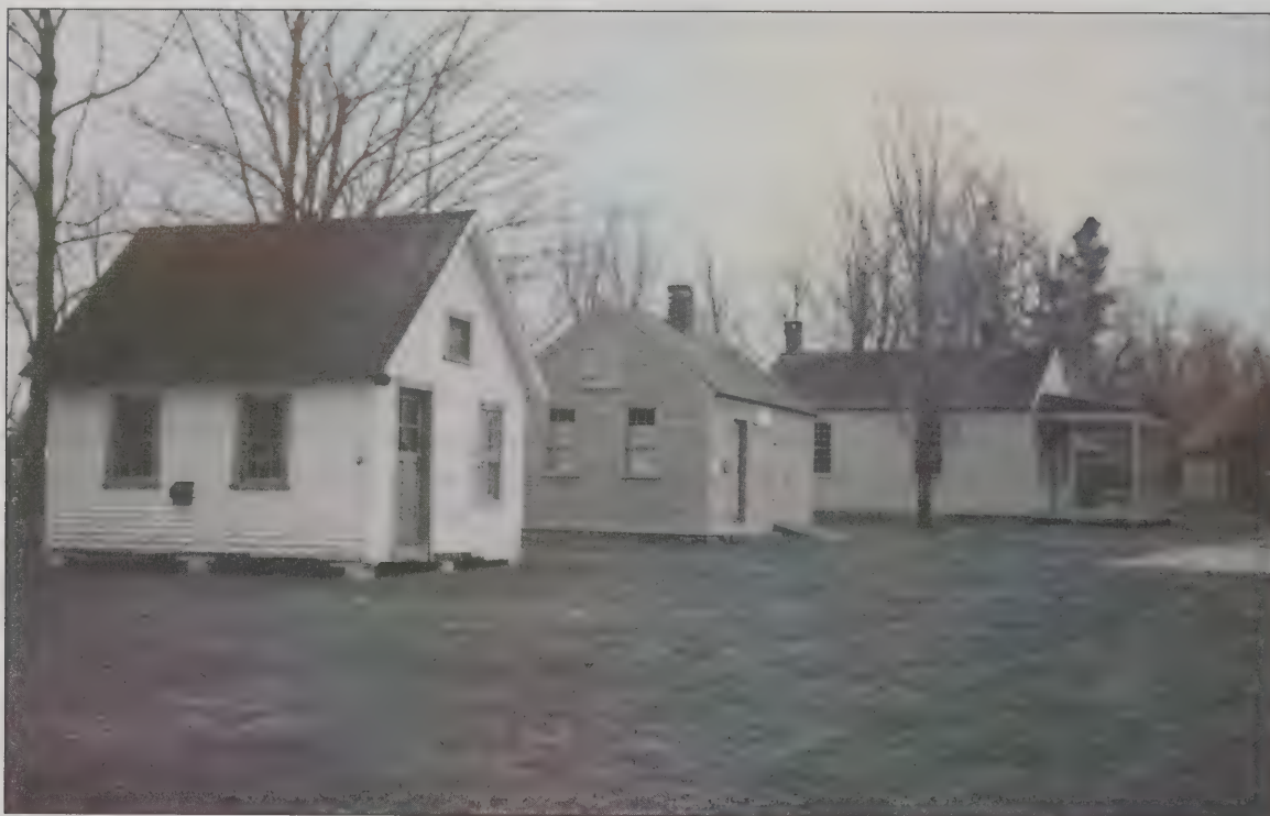
New London Historical Society photo of the new Eagle Hose Fire Company building.