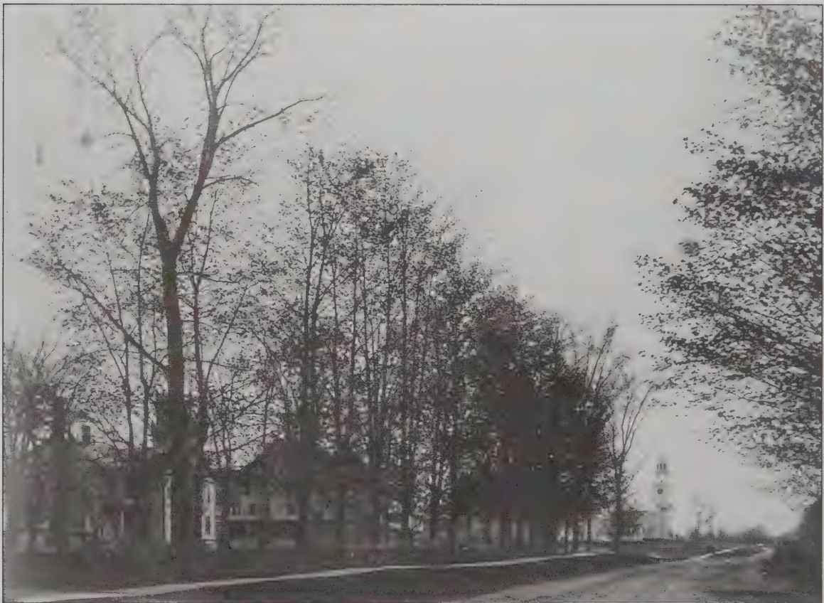
Main Street, New London, early 1900s