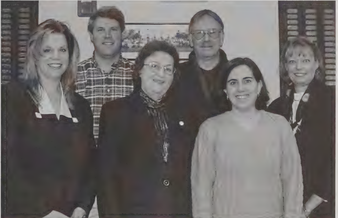
New London Town Office Staff