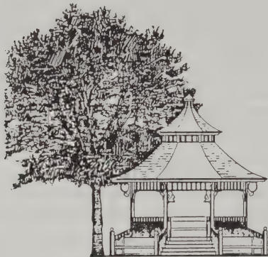
Architect's rendering of the proposed Mary D. Haddad Memorial Bandstand to be built on Sargent Common, New London.

1988 was a busy year for the Town of New London Bandstand Committee. The Committee worked closely with the New London architectural firm of Sheerr and McCrystal in planning and developing a design that would be unique to the Town and also serve the many demands expected to be placed on the structure. The final design adopted by the Committee incorporates some of the elements of the original bandstand that formerly stood on the Common.