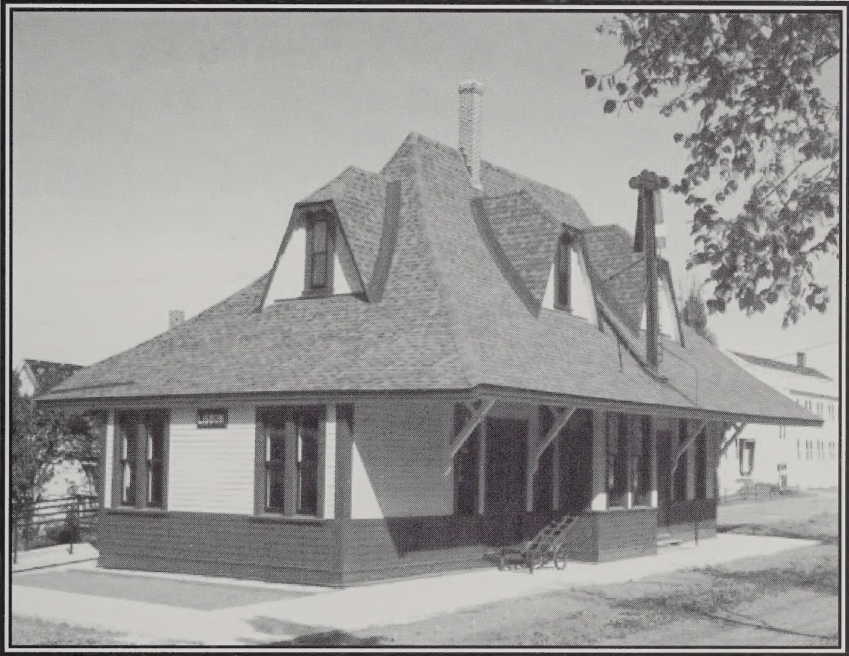
Lisbon Historic Railroad Station