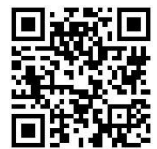
2023 WILDLAND FIRE STATISTICS WILDFIRE

As we prepare for the 2024 fire season, please remember to contact your local Forest Fire Warden or Fire Department to determine if a fire permit is required before doing ANY outside burning. Under State law (RSA 227-L:17) a fire permit is required for all outside burning unless the ground is completely covered with snow. Fire permits are also available online in most towns and may be obtained by visiting www.NHfirepermit.com . The burning of household waste is prohibited by the Air Resources Division of the Department of Environmental Services. You are encouraged to contact the local fire department for more information. Safe open burning requires your diligence and responsibility. Thank you for helping us to protect New Hampshire’s forest resources. For more information, please contact the Division of Forests & Lands at (603) 271-2214, or online at www.nh.gov/nhdfl/ . For up-to-date information, follow us on X and Instagram: @NHForestRangers