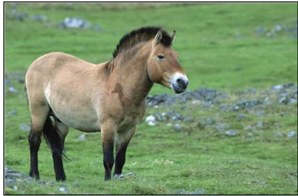
Figure 1. Przewalski's horse ( Equus przewalskii , also known as Mongolian ass, Asian wild horse, Mongolian wild horse, and takhi) is the last remaining true wild horse. Several reintroduced herds survive in Mongolia.

Originally domesticated 5,000 to 6,000 years ago, wild horse populations once roamed much of the Eurasian steppes (Petersen et al., 2013a, 2013b; Warmuth et al., 2011). E/SE Asian indigenous horses are repositories of valuable genetic diversity. Numerous traits have been exploited to develop many of the world's 500 unique breeds. Founding horse populations contained a wealth of genetic diversity. However, because of artificial selection and loss of most of the wild populations, this pool of diversity is disappearing (McCue et al., 2012),