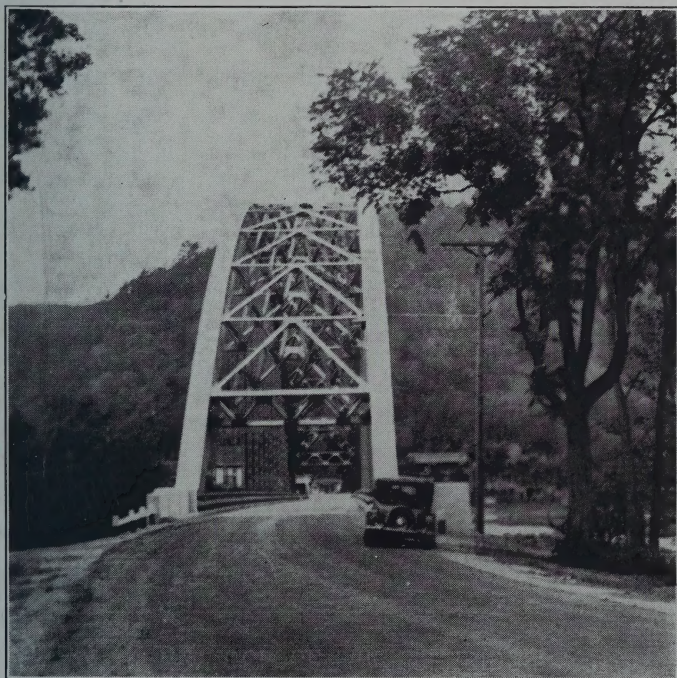
THE NEW ORFORD-FAIRLEE BRIDGE