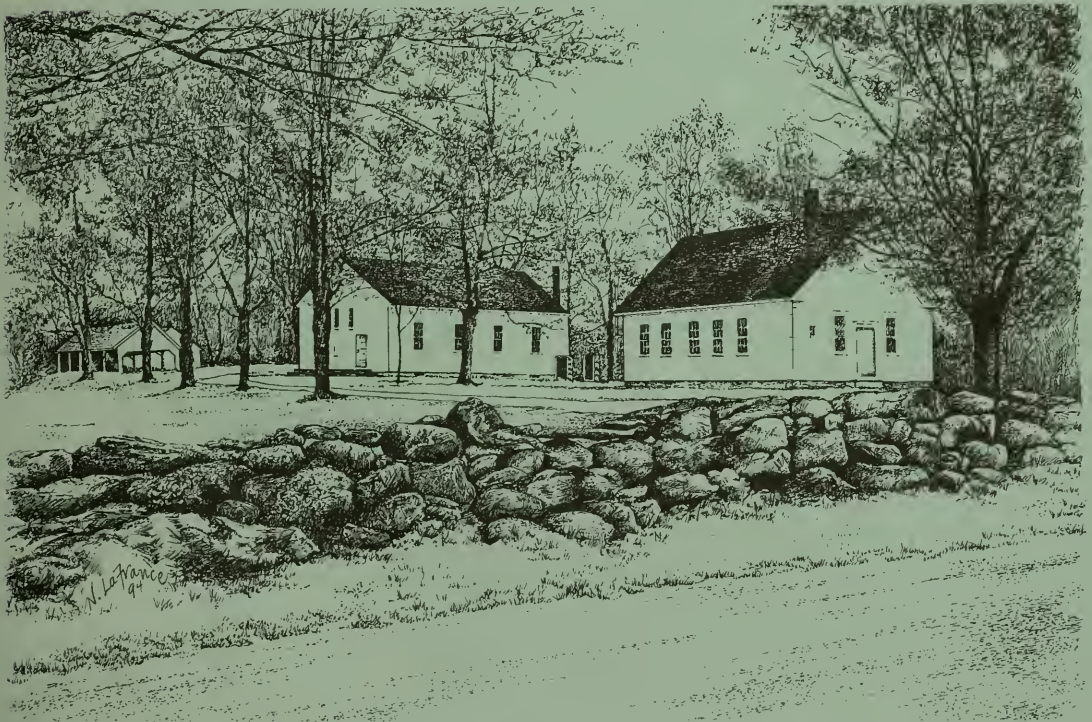
Smith Meeting House