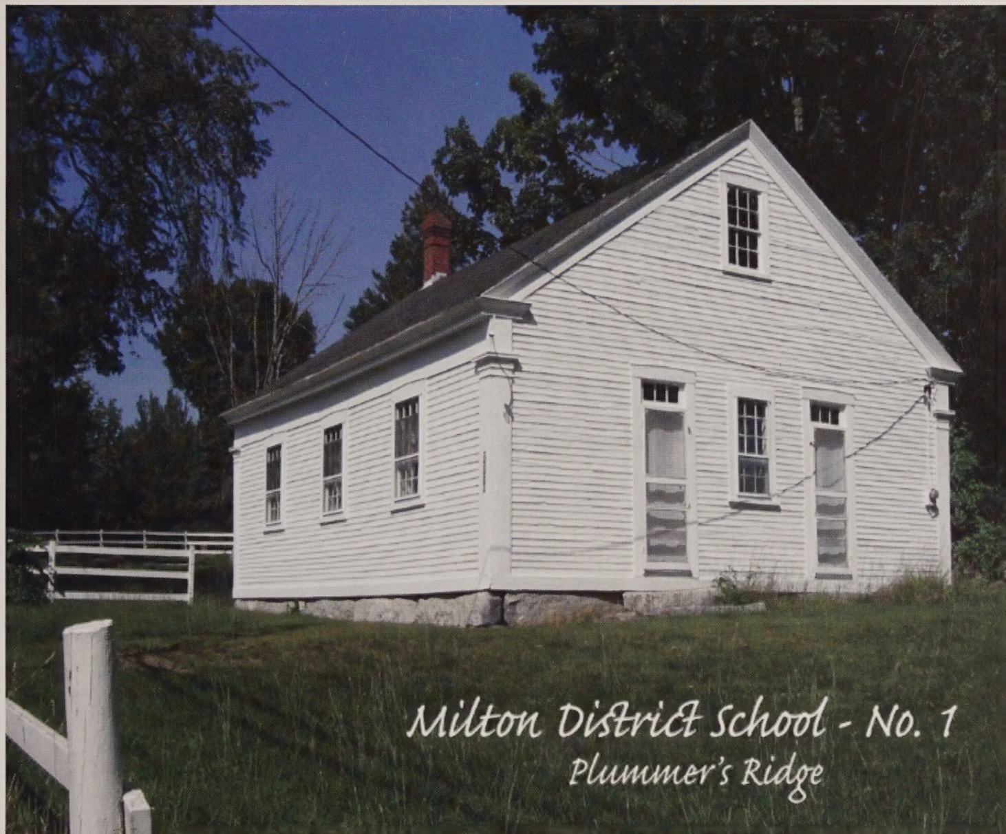
Milton District School - No. 1 Plummer's Ridge