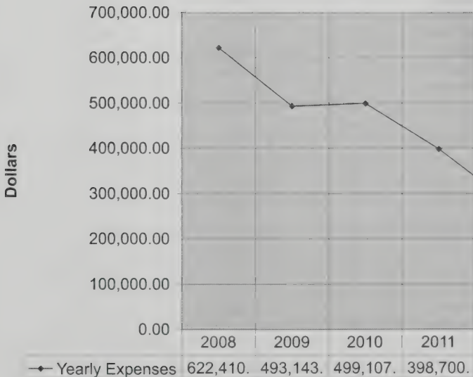
HB Expenses - 2008-2011