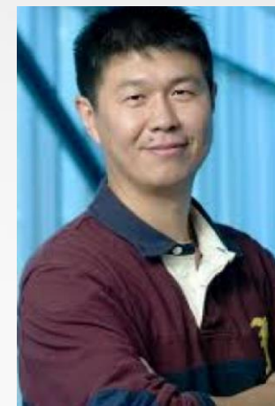
Senator Teng (Fall '18