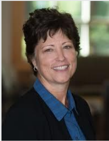
Senator Wilder, Chair