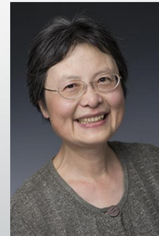
Senator LuYan (Spring '19