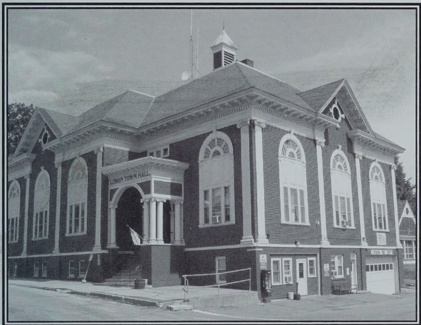
Lisbon Town Hall