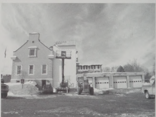
The outside of the steel frame is sided. February 26, 2007