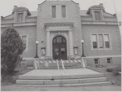
The front stairs are reset and a drainage system installed. May 23, 2007