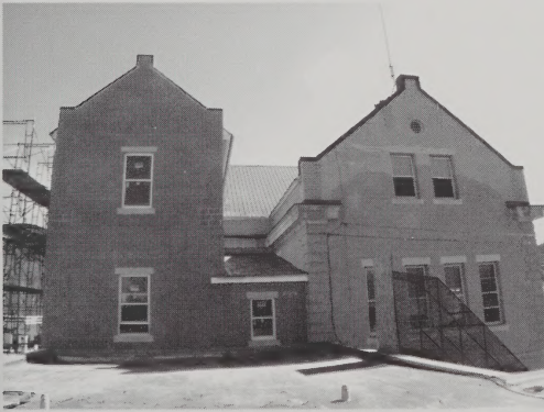
The exterior brick and soffit work is completed. May 6, 2007