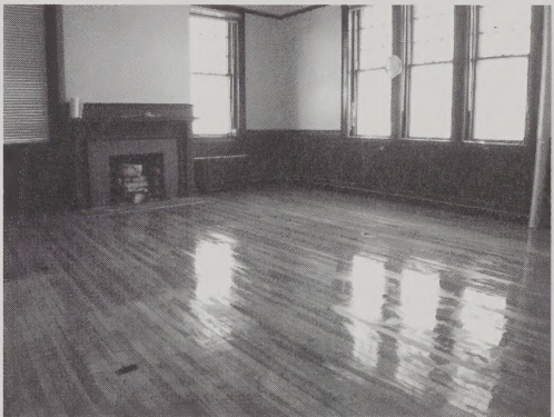
The Select/Planning Boards and Tax Collectors Offices are rehabbed. May 6, 2007