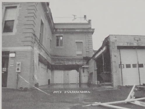
The police car garage is demolished. October 29, 2006