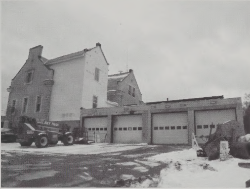
The tower is sealed from the outside and heated. April 13, 2007