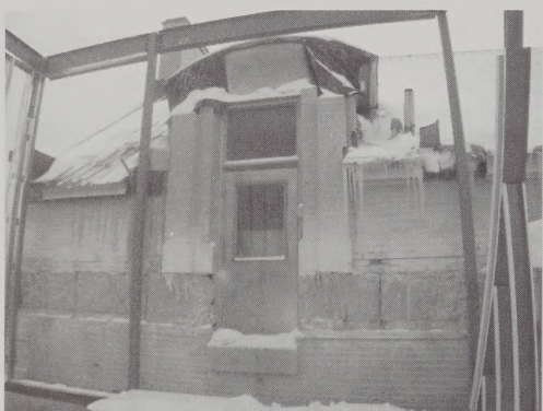
The third floor fire escape is removed. February 9, 2007