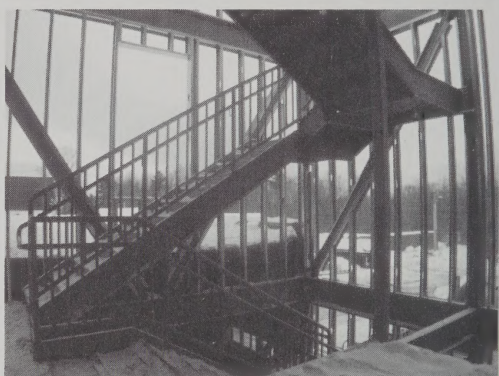
The secondary stairwell is assembled. February 9, 2007