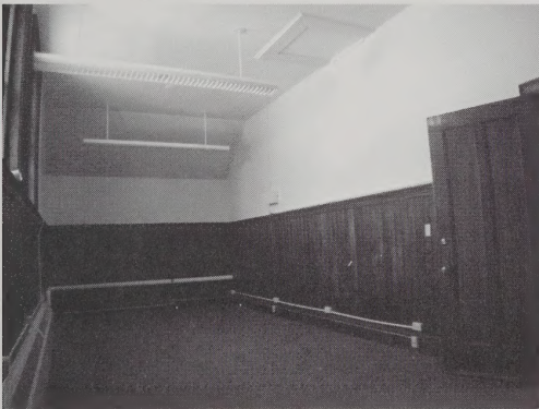
The Town Clerks office is renovated. February 26, 2007