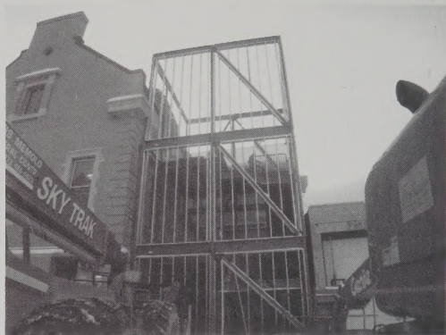
The steel frame for the tower begins. February 9, 2007