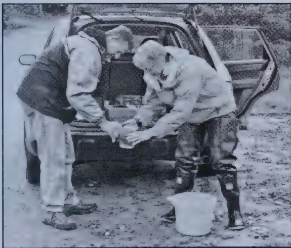
Water testing at Giles Brook