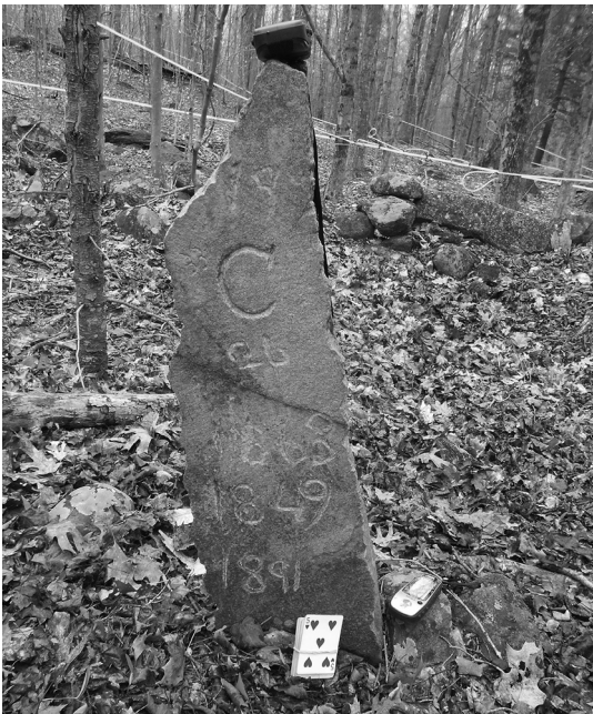
This marker was found off Asby Road.