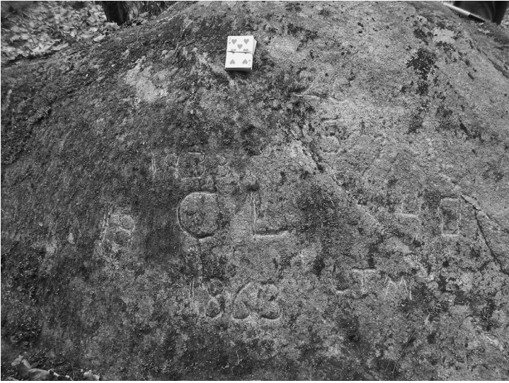
The boundary marker between Canterbury and Loudon. This stone is behind Miles Smith Farm in Loudon.