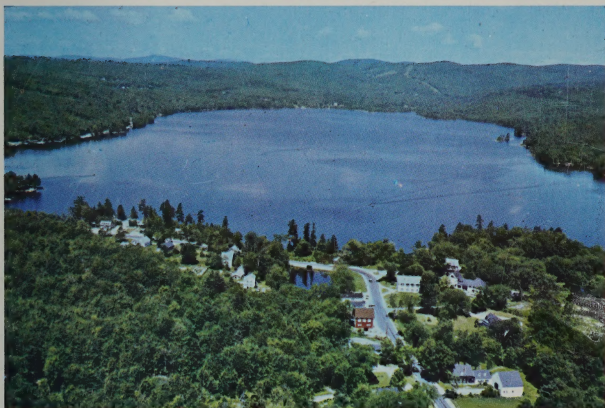
Aerial View of Elkins Village and Pleasant Lake